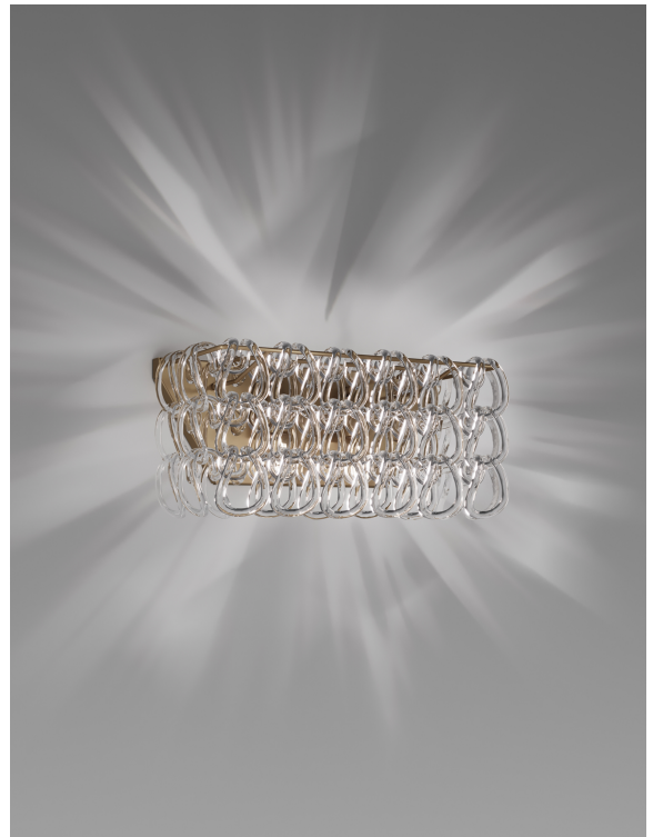
GIOGA AP 2 CRTR BR E27 CE